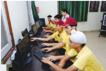
Supervised computer time