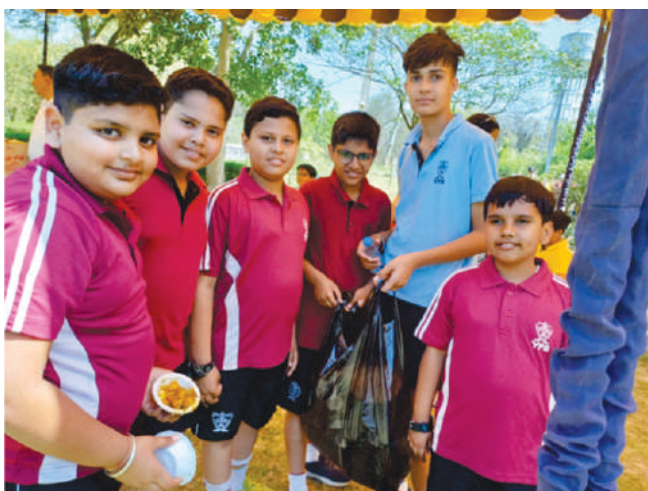
Visit to the Army Cantonment