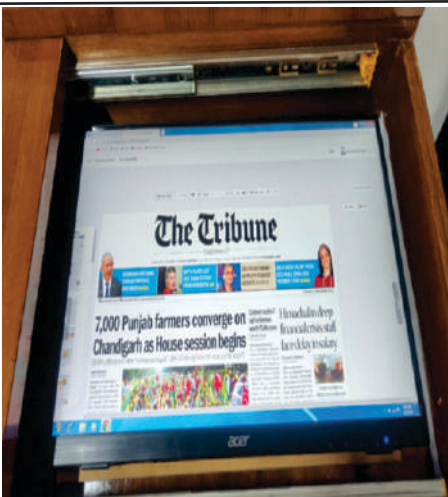
Moving with the Times! Digital Newspaper installed in the Senior School Library.

Remedial classes have been introduced for boarders from July onwards in order to give a boost to their academics. The efforts have paid off and the students have done well in the Half Yearly examinations.