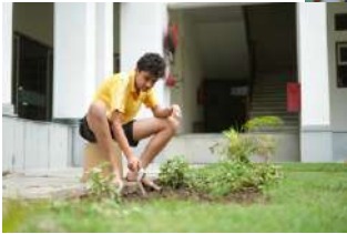
It helps to remain grounded....