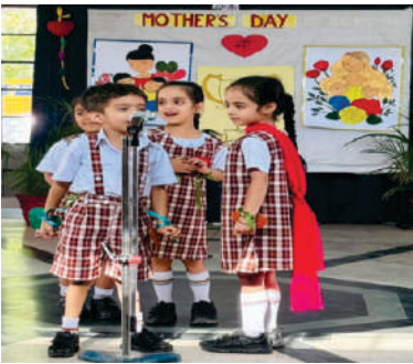
Prep I and Prep II English Recitation