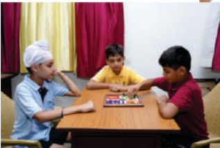
Taking a break from books