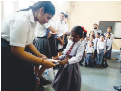
2. Donation drive [Clothes, stationery toys & essential items] in Modern School, Gurmandi & Polo Ground