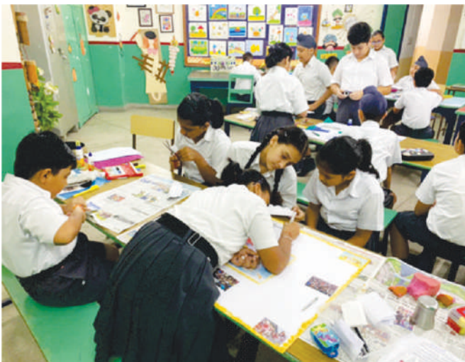
Chart Making Competition

Social Studies chart making competition was held on 30th August for classes IV and V during the school hours. The topics were as follows