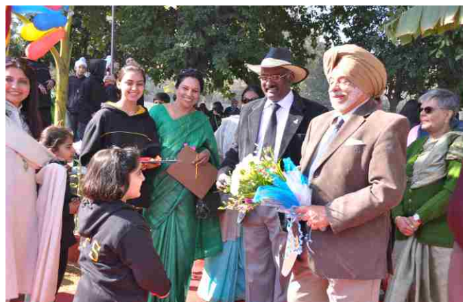
Say it with Flowers- The Chief Guest being welcomed at the Fete

The school celebrated its 63 rd Foundation Day on Wednesday, 2 nd February. The programme started at 9am with the customary Pagal Gymkhana games. These games, unusual but extremely frolicsome and funny in nature, have always been an integral part of this day. These included the Banana Race for the Junior school children, Lemon and Spoon race for the Middle School