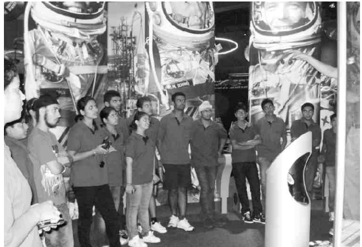
Looking Up- At NASA marvelling a mock shuttle