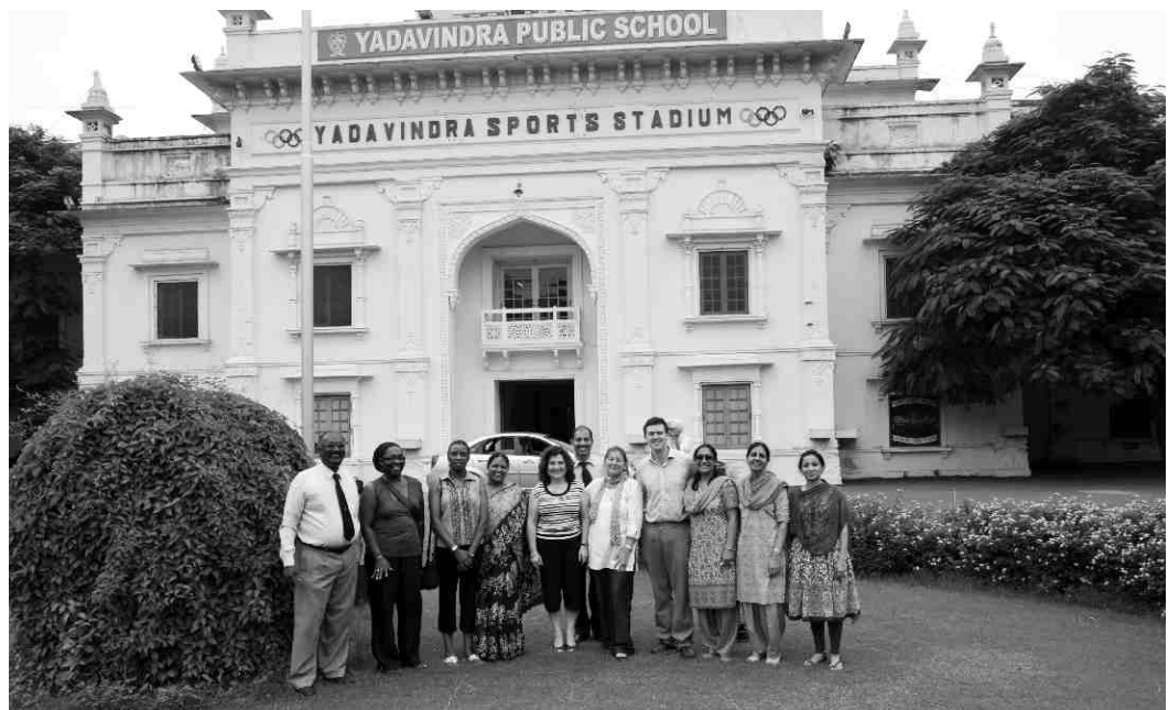
The Principal with the visitors before the School building

The team arrived in the city on Monday, 25 th July, and visited the School on Wednesday, 27 th July, after spending a day, Tuesday, 26 th July, at another partner school, the British Co-Ed High School, Patiala. During their stay, the group inter-acted with the school staff and held workshops including one for the