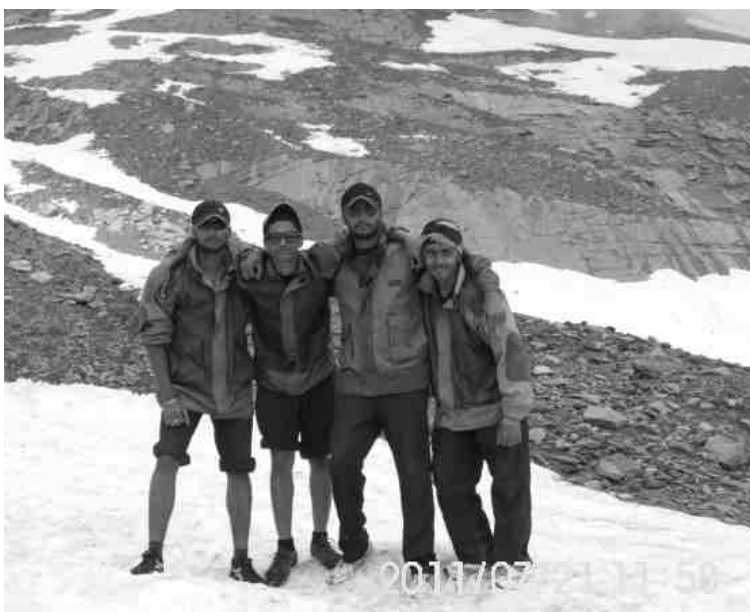
A (Four) midable task!

A group of four students from Class XII, Harkanwal, Manwattan, Harwattan and Sukhman, successfully completed their Basic Mountaineering Course from the Atal Bihari Vajpayee Institute of Mountaineering and Allied Sports, Manali during the summer vacation. A total of 115 trainees were participating in the course from all over India.