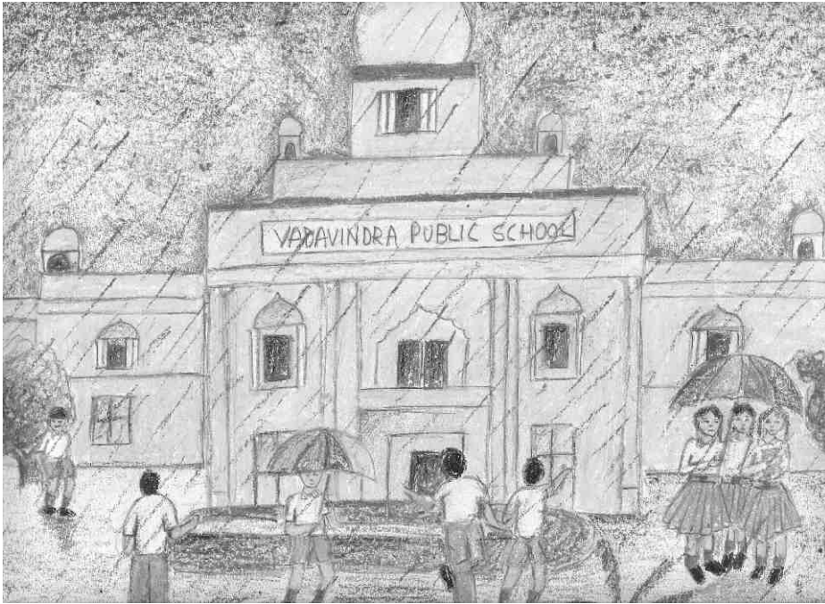
Sketch by Pulak Goel, VIIE

It is hard to walk through rain, but then the pleasures are immense.