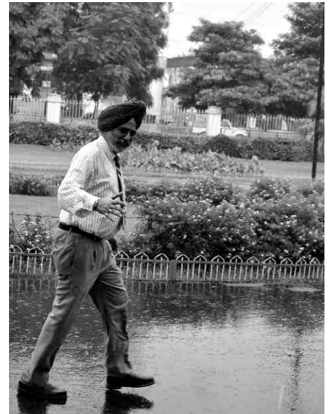
Changing Seasons - The Writer in the Rain

The sometimes chaotic scenes at dispersal time could be avoided if car users who come to the school campus to pick up their wards adhered to the golden rule of traffic -- keep to the Left! As the cars exit the main gate after picking up the Junior School students, the movement should be to the Left, towards the roundabout: no car should take a Right Turn at the gate, as then it blocks oncoming traffic. Rather, cars needing to go to the Nalagarh Park Gate should go around the roundabout and then move down past the State Bank to the park gate. This little co-operation from the guardians and / or their drivers who come to pick up their wards will go a long way in smoothening out the flow of traffic in front of the school.