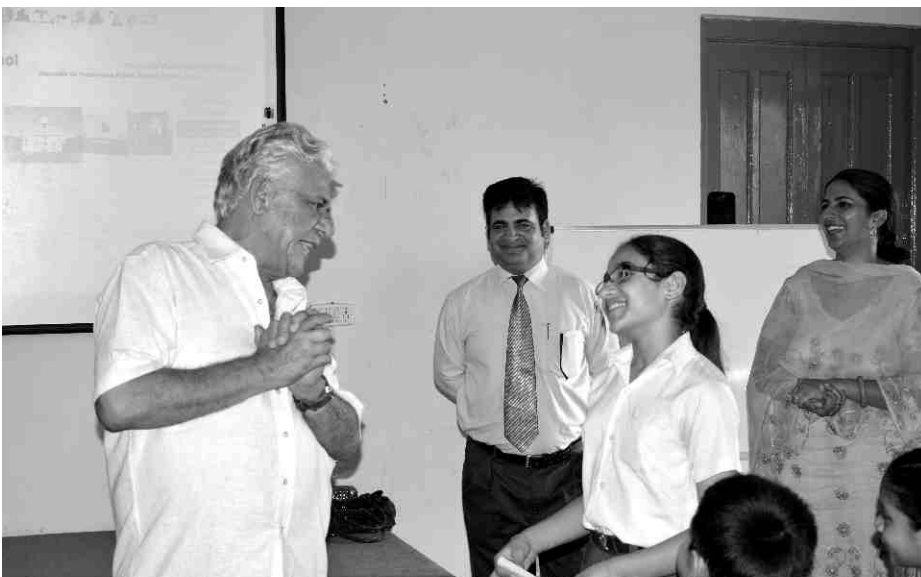
Mr. Om Puri interacts with students