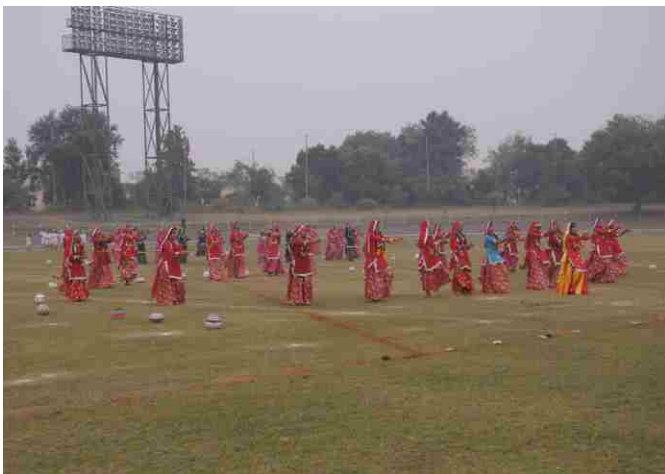
Cultural performances form an integral part of the show -Middle school girls performing a Punjabi folk dance

Two major presentations were made during the ceremony. First, Heena Sidhu, an old Yadavindrian of the