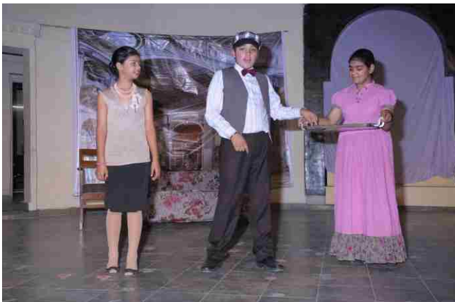
A play being enacted

The Junior school celebrated its Annual Entertainment programme on Saturday, 23rd October. The school choir welcomed the audience with soulful notes, which marked the beginning of the entertainment show. The Prep school students danced into everyone's hearts as they sang of 'Togetherness in Happiness'. In 'Grandpa's Farm', the students spiritedly enacted farm animals. The first play of the evening 'The Magic Mirror of Health' promoted the idea of a fit and healthy generation. The tall trees that you see today, were also saplings one day, was the eco-friendly message in the play 'Saving our Earth'. Class V marched in with élan and took a bow, with equal ease, in their adaptation of the classic, 'The Sound of Music'. The 'Raas leela' and the Russian folk dance showcased a true blend of the