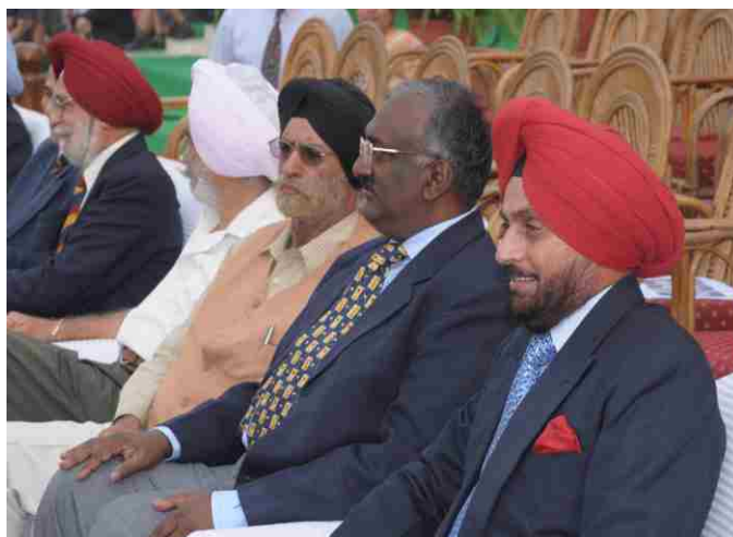
The Principal with the Chief Guest and other dignitaries