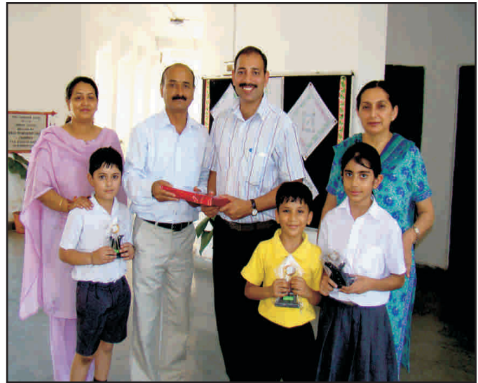
School students with Helpage India official, school staff... and a memento