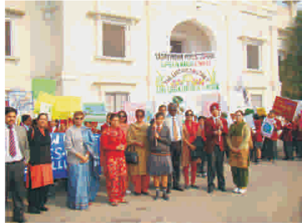
Go Green-The Principal and the Vice-Principal Flag off the March