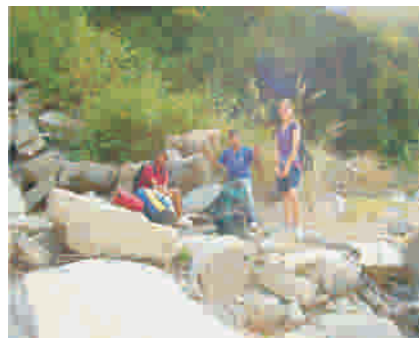
On the Rocks.....

The first hour of walking was quite relaxing- the landscape was quite nice- but after this "relaxing walking" is where everything begins. We begin our ascent on a path bordering a river, going up and down through rocks, some of them bigger than others. The landscape became amazing and beautiful. Natural lagoons and waterfalls surprised me making everything more interesting. We were all exhausted but it didn't make us stop- it was definitely interesting! After almost five hours of walking, we stopped for lunch (we really needed this break to recover our energy to keep walking). We took our backpacks again and were on our way. In spite of the rising temperature, nothing could stop us from going through the hardest part of the trek. Finally, we reached the end of the first part of the trekking to Nakrana. I was really exhausted, so I left my backpack on the floor and sat and rested for a while waiting for the others to come. We rested for about an hour where we had 'chai' and some snacks. Then we began our descent to our final destination. The landscape turned even more impressive, and far away I was able to see the dam where we were going to spend the night after a long and tiring day. We, finally, reached the camping site. We were very tired, so, we set the tents and prepared food. The night went on, and no one slept. I was amazed and impressed with the energy the students