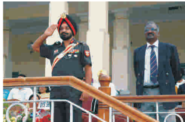
The Chief Guest taking the Salute

Face reddening heat, aching bones, cramps making the body numb, were some of the things that stood our way in the month of October, Only the wearer knows where the shoe pinches –but then no excuses–after all ,Sports day had to be a success. All problems, all travails had to crumble under the heavy weight of the collective will and determination.