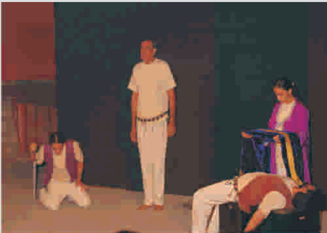
Macbeth lies dead as Lady Macbeth and other Characters look on

* Two plays by William Shakespeare, 'Macbeth' and 'The Midsummer Night's Dream', were staged on Saturday, 7 th November, in the School Amphitheatre. Both the plays were performed by the Wide Aisle Productions, a theatre group based in Gurgaon. This innovative group comprising of people from various walks of life aims to promote and encourage students' interest in the plays of William Shakespeare. The group that came into existence in 2007 has already performed in a number of schools to