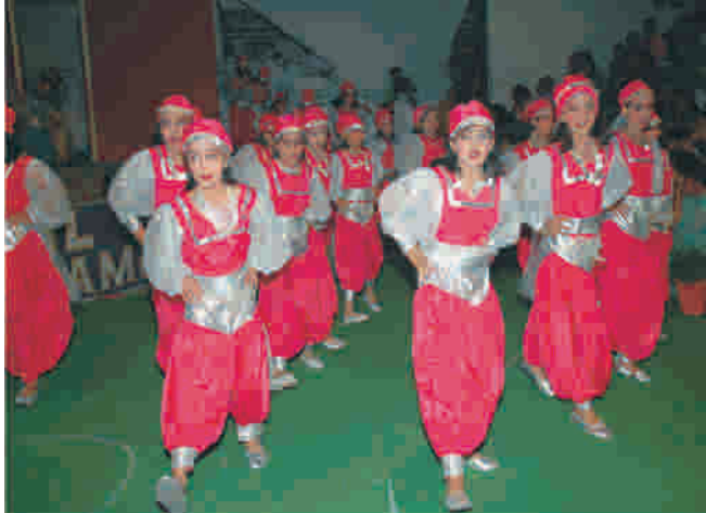
The Dance of Delight — Girls gyrating to Arabic Tunes

All hundred and eighteen children of class I could be seen dressed up in various professional attires of sailors, cooks, policemen and doctors. With their 'Jungle Rock'.class II children spread a wave of awareness of preserving nature.