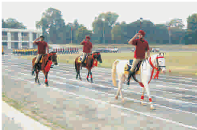
Leading the March-Horse Riders, besides riding skills, displayed an impressive tent-pegging show.